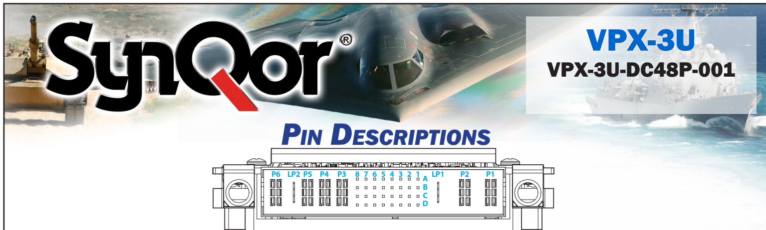
3U P0 Connector